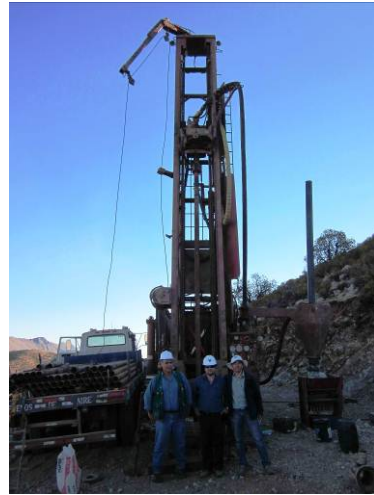
Helix's Chile technical team in front of rig at JO-001