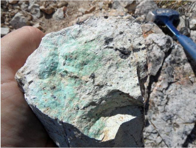
Plate 1: Copper oxides in silica altered porphyry- Joshua Project